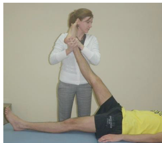
FIG. 3. Mulligan traction straight leg raise technique.